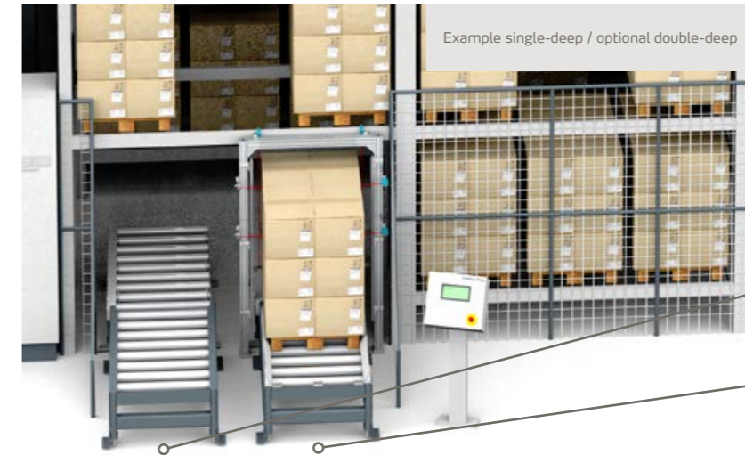
Example single-deep / optional double-deep